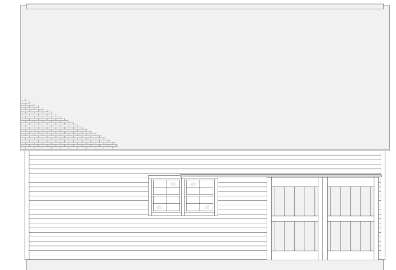
DOORS & WINDOWS BY OTHERS

THIS DRAWING PACKAGE ILLUSTRATES THE FEATURES AND DETAILS OF THE SHELTER-KIT BUILDING DESCRIBED AND IS PROVIDED FOR THE OWNER NAMED. IT IS NOT TO BE USED TO SPECIFY MATERIALS, DIMENSIONS OR DESIGN VALUES FOR THE CONSTRUCTION OF ANY OTHER BUILDING OR COPY OF THIS KIT.