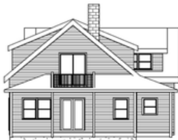
④ WEST ELEVATION 3/32" = 1'-0"