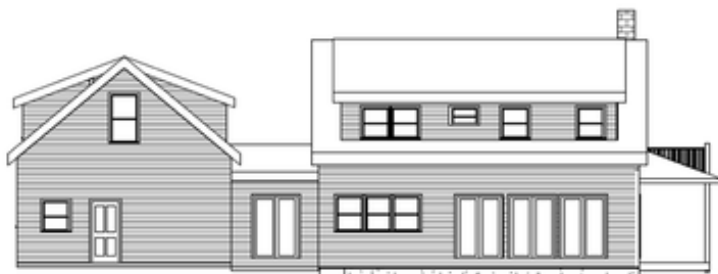
① NORTH ELEVATION 3/32" = 1'-0"