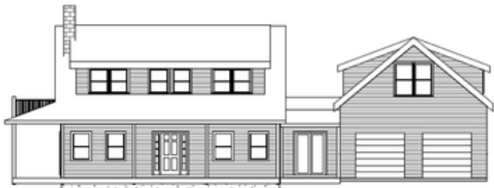
③ SOUTH ELEVATION 3/32" = 1'-0"

THIS DRAWING PACKAGE ILLUSTRATES THE FEATURES AND DETAILS OF THE SHELTER-KIT BUILDING DESCRIBED AND IS PROVIDED FOR THE OWNER NAMED. IT IS NOT TO BE USED TO SPECIFY MATERIALS, DIMENSIONS OR DESIGN VALUES FOR THE CONSTRUCTION OF ANY OTHER BUILDING OR COPY OF THIS KIT.