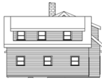
② EAST ELEVATION 3/32" = 1'-0"